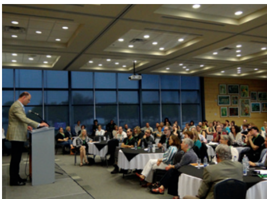
Trevor Holder Minister, Tourism, Heritage and Culture