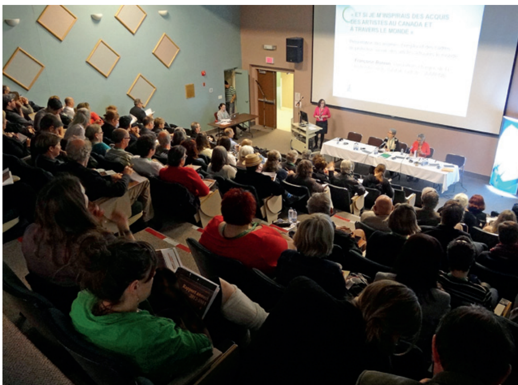
A full house during the Forum's plenary.

The Association acadienne des artistes professionnel.le.s du Nouveau-Brunswick (AAPNB), in collaboration with ArtsLink NB and with the participation of the Assembly of First Nations Chiefs of New Brunswick, organized a Forum on the Professional Status of Artists which took place from May 31 to June 2, 2013. With a total of 164 participants, this was the largest gathering of artists from every community—Aboriginal, Anglophone, and Acadian—held in the province since 1987. Over a busy weekend in Shippagan artists and partners discussed issues relating to the artist's profession and proposed possible solutions which could lead to concrete improvements the working conditions, remuneration, and social security of artists in the province. The Forum was made possible by the financial support of the Department of Tourism, Heritage and Culture, the Regional Development Corporation, and New Brunswick Intergovernmental Affairs.