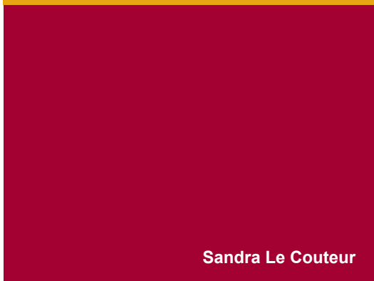
Sandra Le Couteur